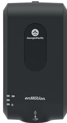
Black Staples # 2566951