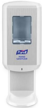
White Staples # 24358185