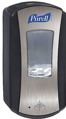
Black/Chrome Staples # 475107