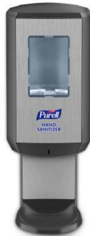
Graphite Staples # 24358186

PURELL® Advanced Hand Sanitizer Foam, 1200mL Hand Sanitizer Refill for PURELL CS6 Touch-Free Dispenser 2/CT Staples Item # 24460244