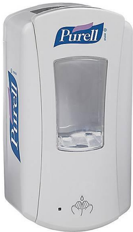
White Staples # 375630

Purell® Advanced Instant Foam Hand Sanitizer LTX-12™ Refill, 1200ml, 2/Ct Staples Item # 318577