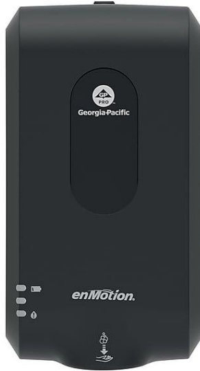
Black Staples # 2566951