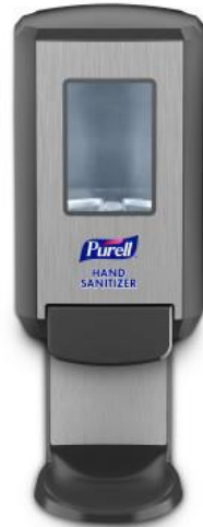
Graphite Staples # 24358188

PURELL Advanced Foaming Hand Sanitizer Refill for CS4 / FMX Manual Dispenser, 1200mL., 4/Carion