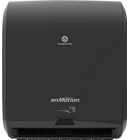
Black Staples # 2721187

Georgia-Pacific® enMotion® High Capacity Roll Towel