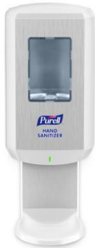
White Staples # 24462247

"Energy-on-the-refill" technology - every refill has a built-in energy source, designed to last as long as the refill