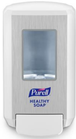
White Staples # 2801204