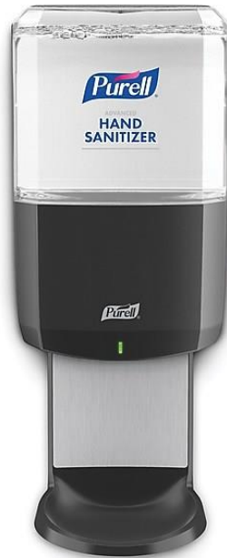
Refill Sold Separately