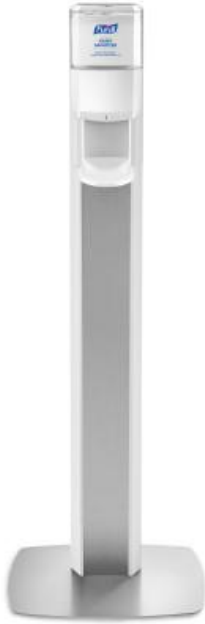
PURELL® MESSENGER™ ES8 Hand Sanitizer Floor Stand with Dispenser, Silver Panel Item #: 2847470 Price: $172.34