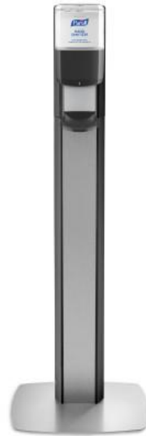
PURELL® MESSENGER™ ES8 Hand Sanitizer Floor Stand with Dispenser, Silver/Graphite Item #: 2847433 Price: $190.27