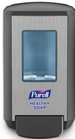
Graphite Staples # 24462246

PURELL® Professional HEALTHY SOAP® Mild Foam, CS4 Foam Dispenser Refills, Fragrance-Free, 4/CT