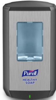
Graphite Staples # 2801404

"Energy-on-the-refill" technology - every refill has a built-in energy source, designed to last as long as the refill