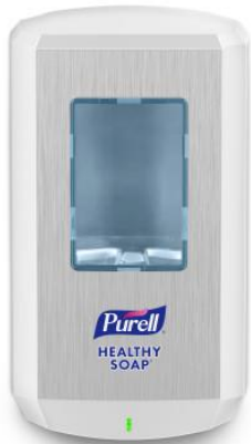
White Staples # 2801418