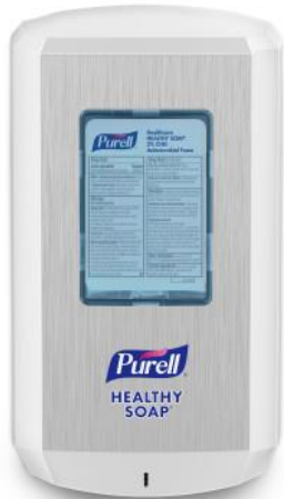
White Staples # 2801407