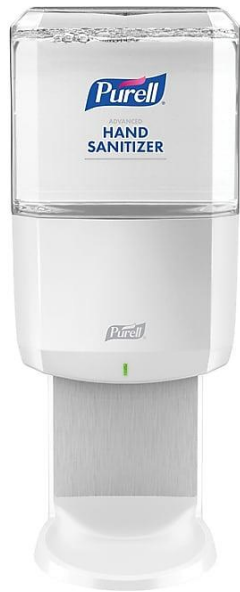
White Staples # 2728956