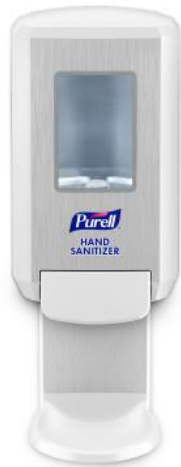
White Staples # 24358187