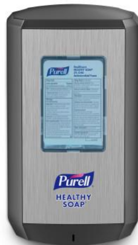
Graphite Staples # 2801406

PURELL® Professional HEALTHY SOAP® Mild Foam, CS6 Foam Dispenser Refills, Fragrance-Free, 2/CT