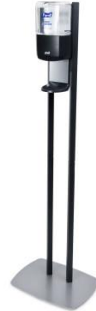
PURELL ES6 Hand Sanitizer Floor Stand with Dispenser, Graphite Item #: 24475192 Price: $146.84