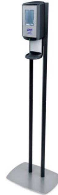
PURELL CS8 Touch-Free Dispenser Floor Stand for PURELL Hand Sanitizer, Black/Chrome Item #: 24477109 Price: $109.94