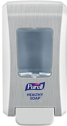
White Staples # 2728963