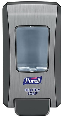
Graphite Staples # 2728962

PURELL® Professional HEALTHY SOAP® Mild Foam, Fragrance-Free